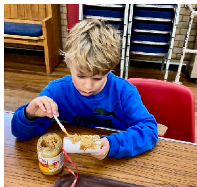
Toilet rolls and peanut butter are genius bird feeders!