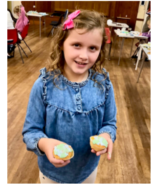
Good enough to eat!