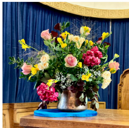
13 October - Norma Reid for her parents, with love