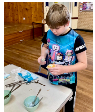
The icing on the cake

The event ended with soup and tasty shepherd's pie.