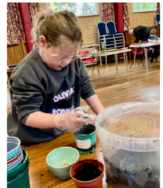
I might be a second Beth Chatto...

We had activities based on the theme. There were seeds to plant and bulbs which we hope will flower in time for Christmas. Everyone enjoyed sewing round a picture of the world, and cutting out hand shapes to attach to a heart-shaped world. We had a go at printing leaf prints admiring the different colours and shapes of the leaves. We also made bird feeders covering used toilet rolls in peanut butter and rolling them in birdseed. Even icing the cakes this month continued the theme with green and blue icing creating a picture of the world.