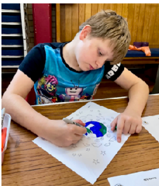
Our Wonderful World