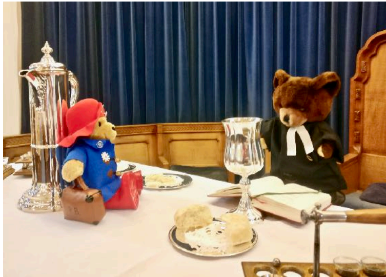
St Andrew's Walton-on-Thames - Easter Day.

We had two very special visitors at St Andrew's on Easter Day: Paddington Bear and The Revd Wesley Bear. Paddington is currently touring the Wessex Synod and spent Easter Week with us, having spent Holy Week in our sister church at Weybridge. Paddington was really pleased that there was a fellow bear preaching that day, although Wesley did rather frighten him with his very stern look. At the end of his visit, Paddington wrote up his diary and thought he'd like to share with us what he wrote.