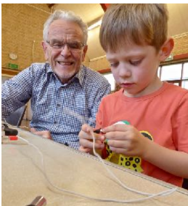
WOW, the light's come on!