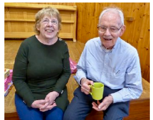
It takes all ages to make up Messy church!