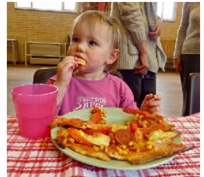
Super-scrumptious - and I made it all by myself!

Very popular was making - and later eating - pizzas with a choice of toppings.