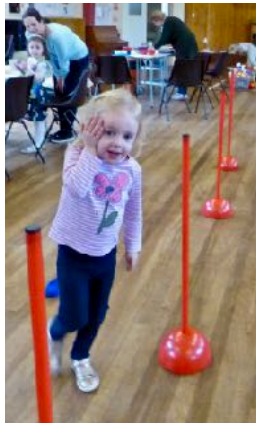
Oops I dropped it...

We all attempted to beat the clock going round the slalom course balancing a bean bag on our head.