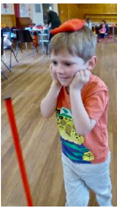
Can I beat my record?